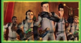
Join the original cast as the new recruit, an experimental equipment technician!

Battle Stay Puft, Slimer and a host of terrifying new ghosts in an all new adventure written by the creators of the original movies, featuring the voices and likenesses of the original Ghostbusters crew! Use all the newest experimental equipment to control the chaos - from the free-roaming vapors to focused non-terminal repeating phantoms...and worse!