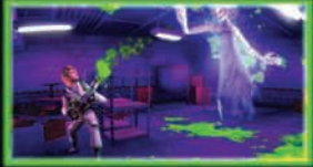
Bust ghosts with an arsenal of new equipment and gadgets!