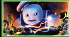
Eliminate paranormal threats in the co-op campaign mode!